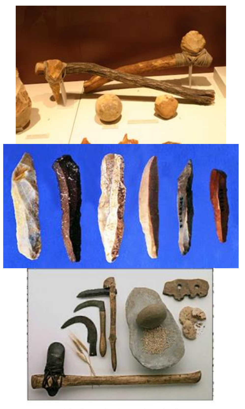
TOOLS WHICH ARE MADE OF SILEX