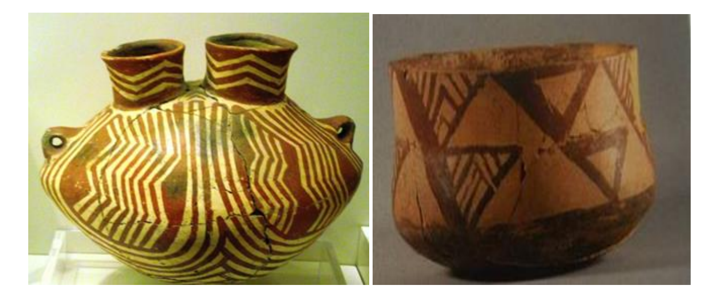
TERRACOTA POTS AND PANS